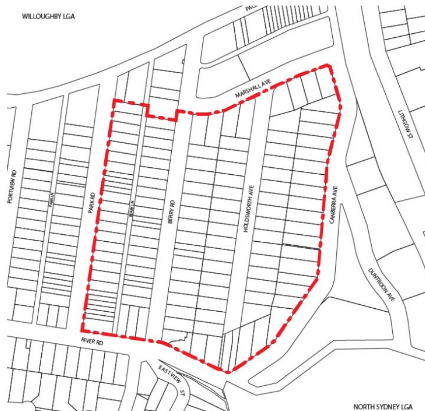
Figure 1: St Leonards South Precinct

The St Leonards South Precinct is bounded by Marshall Avenue to the north, Canberra Avenue to the east, Park Road to the west and River Road to the south as shown in Figure 1 below. Key features of the locality within which the precinct is situated include the Pacific Highway, rail/metro to the east, a commercial centre (St Leonards Plaza and St Leonards Square) and Newlands Park and Gore Hill Oval.