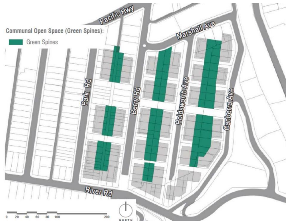
Figure 4: Green Spines (Shaded Green)