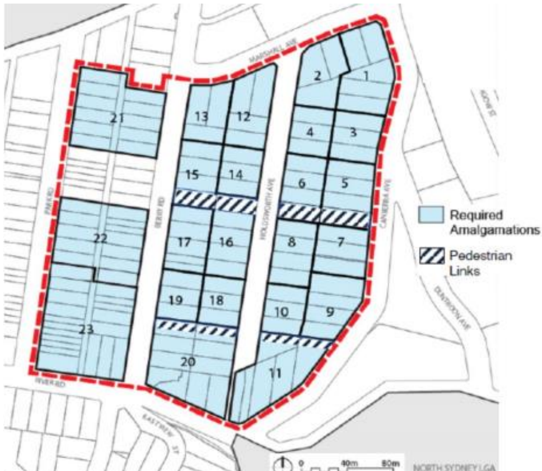
Figure 3: St Leonards South Precinct – Area Designation

The key provisions of Lane Cove Local Environmental Plan 2009 are summarised as follows: