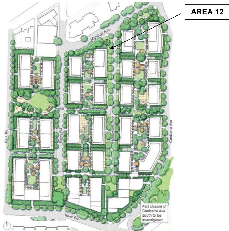
Figure 5: Subject Site in Future Envisaged Context